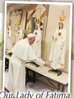
Our Lady of Fatima with her Immaculate Heart blessed by Pope Francis