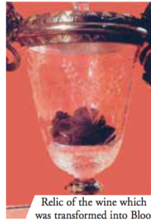
Relic of the wine which was transformed into Blood