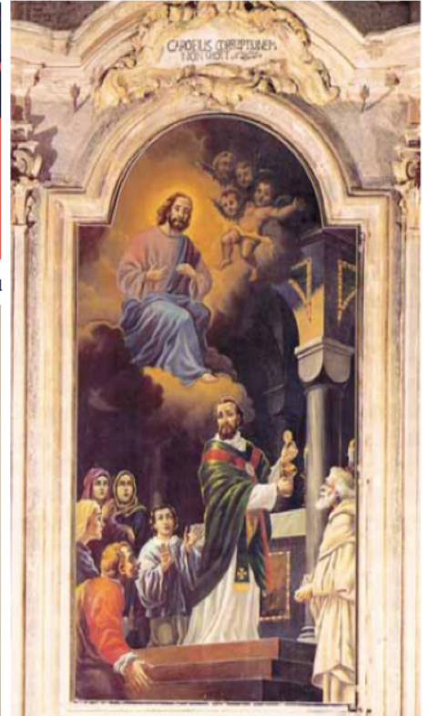
Painting located in the Valsecca chapel which depicts the miracle

blood are human, and the immuno-hematological test allows us to affirm with complete objectivity and certitude that both belong to the same blood type AB—the same blood type as that of the man of the Shroud [of Turin] and the type most characteristic of Middle Eastern populations; the proteins contained in the blood have the normal distribution, in the identical percentage as that of the serous-proteic chart for normal fresh blood; and no histological dissection has revealed any trace of salt infiltrations or preservative substances used in antiquity for the purpose of embalming. Professor Linoli also discarded the hypothesis of a hoax carried out in past centuries.