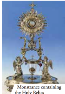
Monstrance containing the Holy Relics