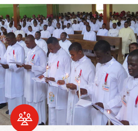
Formation of seminarians and priests