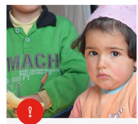
Emergency assistance for Christian Refugees