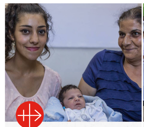
The projects most in need

In fact, we are the only international Catholic charity dedicated to this mission.