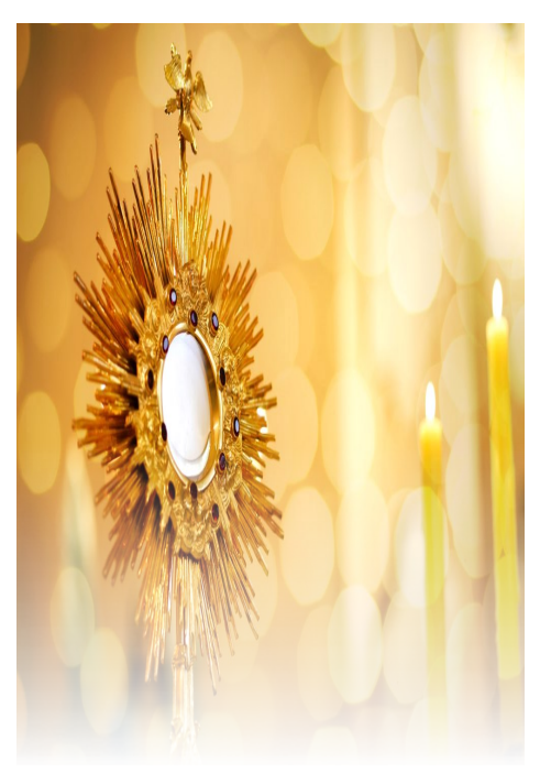
Make frequent visits to Jesus in the Blessed Sacrament and the devil will be powerless against you.