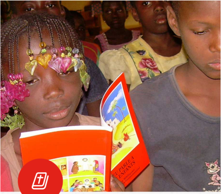
Distribution of bibles and religious books