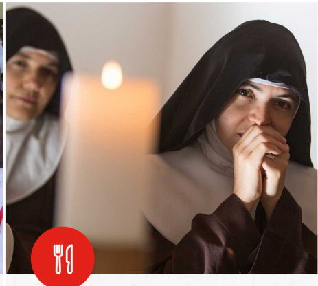
Existence help for religious sisters