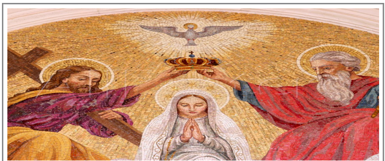
The Assumption of the Blessed Virgin Mary