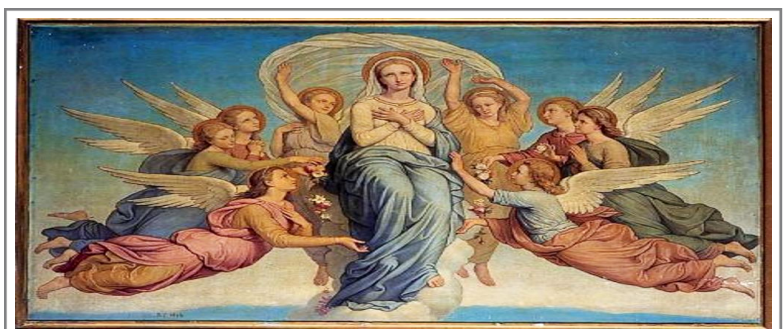
The Coronation of the Blessed Virgin Mary