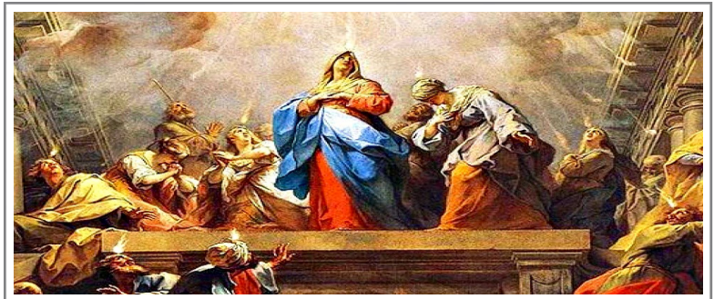
The Descent of the Holy Spirit