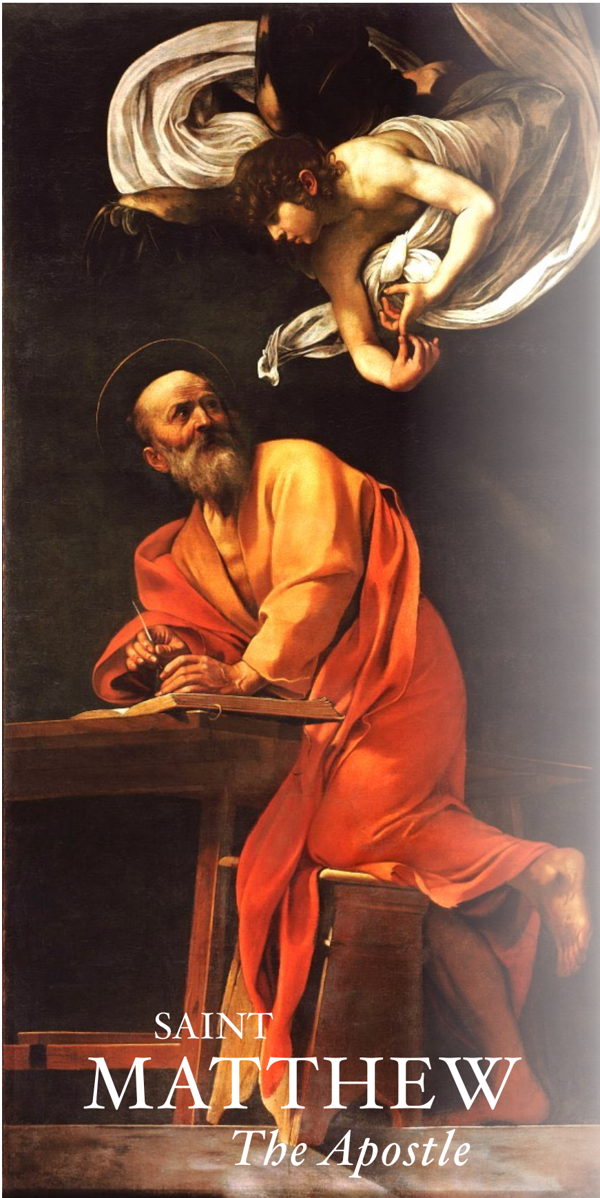
SAINT MATTHEW The Apostle

On Saturday the Church celebrates the Feast of St. Matthew the Apostle and Evangelist. There is little known about St. Matthew, except that he was the son of Alphaeus, and was likely born in Galilee. He worked as a tax collector, which was a despised profession during the time of Our Lord. According to the Gospel, St. Matthew was working at a collection booth in Capernaum when Our Lord came to him and said, "Follow me" (Mt. 9:9). With this simple call, St. Matthew became a disciple of Christ.