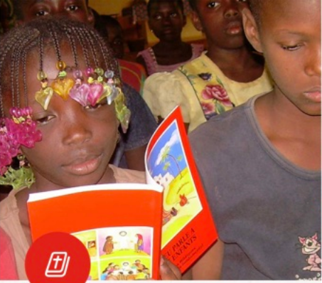
Distribution of bibles and religious books