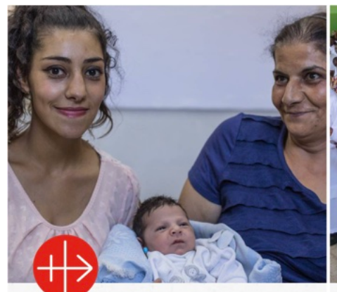
The projects most in need

In fact, we are the only international Catholic charity dedicated to this mission.