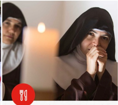
Existence help for religious sisters