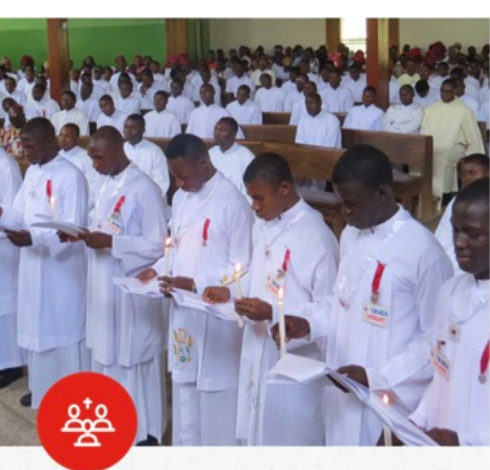
Formation of seminarians and priests