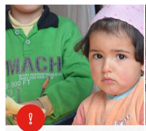
Emergency assistance for Christian Refugees