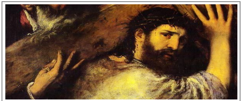
The Carrying of the Cross