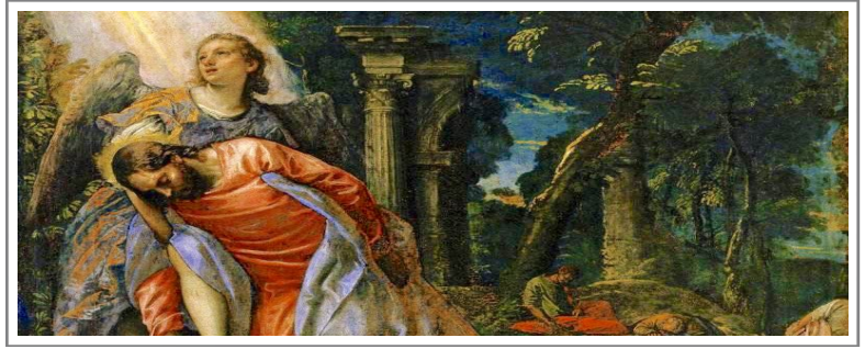
The Agony in the Garden

We adore you, O Christ, and we praise you. Because by your Holy Cross, you have redeemed the world.