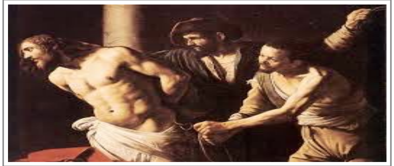
The Scourging at the Pillar