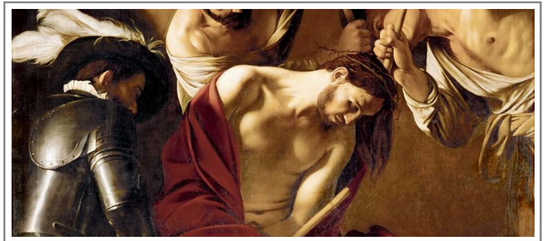
The Crowning with Thorns