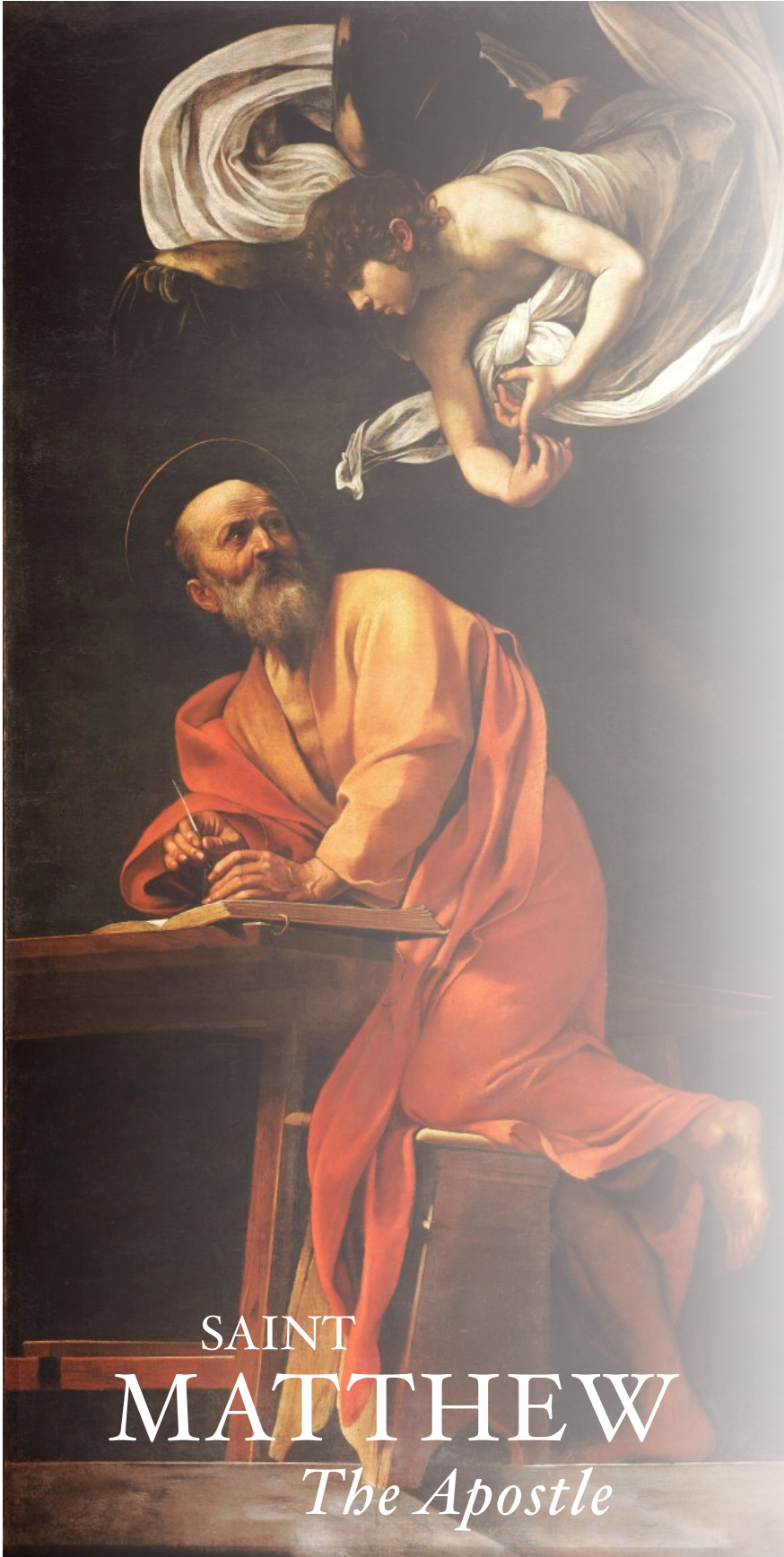
SAINT MATTHEW The Apostle

On Thursday the Church celebrates the Feast of St. Matthew the Apostle and Evangelist. There is little known about St. Matthew, except that he was the son of Alphaeus, and was likely born in Galilee. He worked as a tax collector, which was a despised profession during the time of Our Lord. According to the Gospel, St. Matthew was working at a collection booth in Capernaum when Our Lord came to him and said, "Follow me" (Mt. 9:9). With this simple call, St. Matthew became a disciple of Christ.