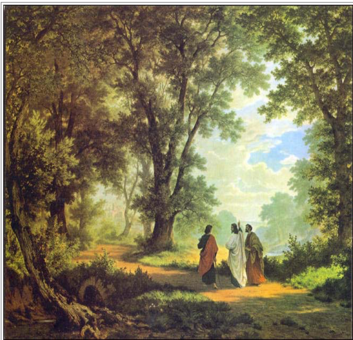
“Gang nach Emmaus” (“The Road to Emmaus”) by Robert Zünd (1877). Public Domain.

The disciples recognised the Lord Jesus in the breaking of the bread, alleluia.