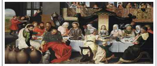
The Wedding at Cana