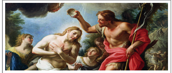
The Baptism of Jesus

The most sacred object on the face of this earth is the Holy Eucharist. On meditating upon the mystery of the institution of this great sacrament, we should beg the Lord for a greater desire to receive Him, hidden behind the accidents of bread and wine. A bishop once told of a conversation he had with a Protestant. "Do you really and truly believe that that bread and wine become the actual body and blood of Jesus?" the Protestant asked. "Absolutely I do, you don't?" asked the bishop. "No, I don't," said the Protestant. "But I'll tell you one thing: If I did believe it, I would crawl over broken glass daily to receive Him!"