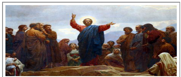
The Proclamation of the Kingdom