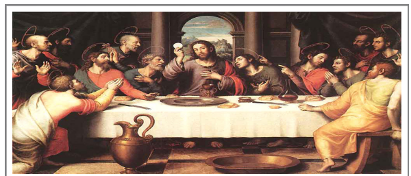
The Institution of the Eucharist