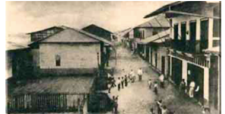
Tumaco at the time of the 1906 miracle