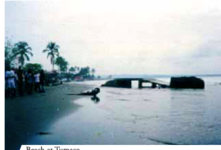
Beach at Tumaco

was building up and threatening to drown everyone and everything in one gigantic wave.