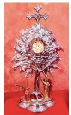
I CENTENARIO DE LAS SAGRADAS FORMAS INCORRUPTAS SILLA, 1907 - 2007