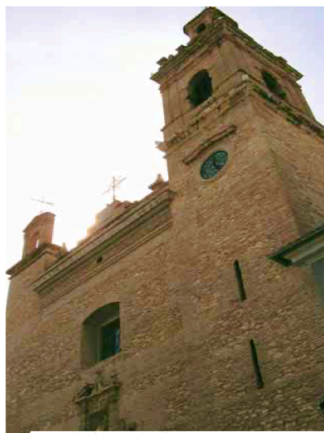
Our Lady of the Angels, Silla