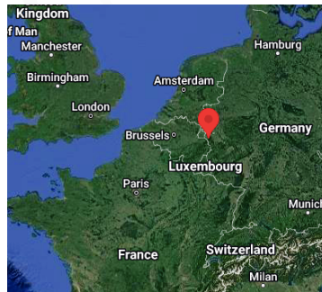
The location of the town of Stich in Germany

Five weeks later, at 8:00 in the evening on Tuesday, July 14, the Swiss Priest was to celebrate another Mass in Stich. He carefully examined the altar stone, the altar cloths, the corporal and the chalice prior to Mass and made sure they were completely clean and undamaged. Shortly after the Consecration, the red spots appeared again on the corporal. The Priest invited the congregation to inspect the stains after Mass, and they later testified to what they saw. The sacristan and various members of the congregation provided sworn testimony about what they had seen on the cloths. According to all the testimony, one stain was the size of the priest's large Host and the other stains were the size of the Hosts given to the congregation. A cross was clearly visible in the red stains.