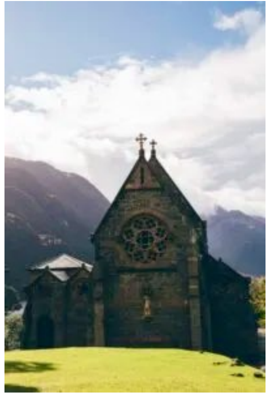
The church in Stich where the two miracles took place in 1970

The cloths were again sent for analysis, this time to the District Hospital of Cercee, and again, the