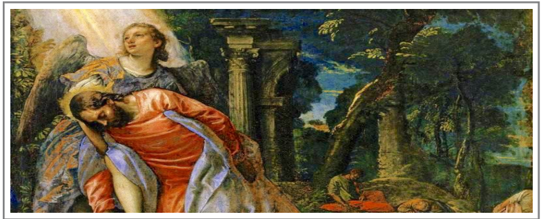
The Agony in the Garden

We adore you, O Christ, and we praise you. Because by your Holy Cross, you have redeemed the world.