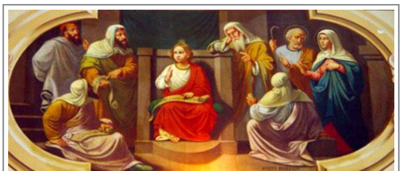
The Finding of Jesus in the Temple