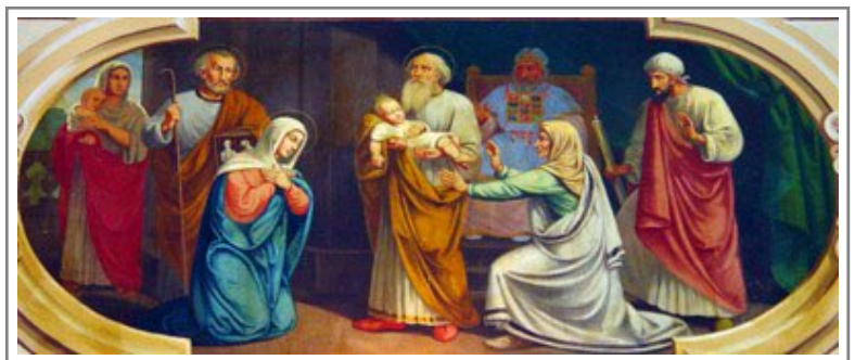
The Presentation in the Temple