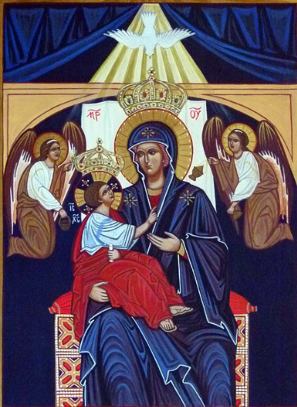
Our Lady of Divine Love Pray for Us